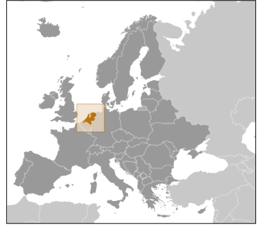
BIKKEL 2012 Griffis Art Center's International Artist-in-Residence from Curacuo / Vlaardingen, Kingdom of the Netherlands